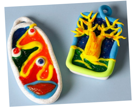
Special Together Time Charms