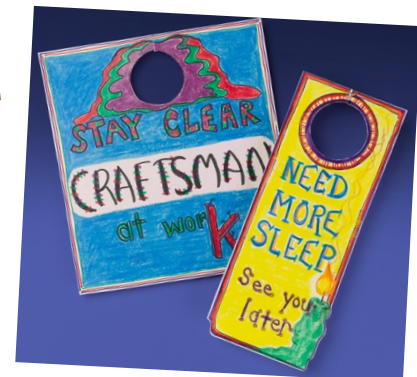
Dad's Door Knob Hangers