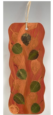
Leaf Time to Read Bookmark